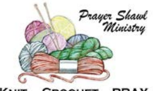
KNIT. CROCHET. PRAY.

Do you know of someone who would benefit from a crocheted/knitted lap blanket or prayer shawl? These donations have been lovingly made by members (and non-members) of our church and have been prayed over and are for anyone who is experiencing a difficult time. Contact the front office if you would like to provide us with the name of someone who would like to receive one of these items.